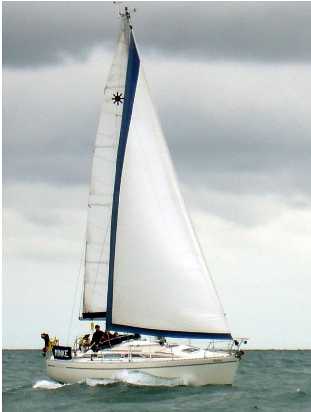
Minke making good progress off Brighstone Bay

The good sailing winds south of the Isle of Wight resulted in many yachts arriving at the Needles Channel between 1515 and 1615. This was well in advance of an eastward Solent tidal flow. The result being that yachts had now to battle against a tidal flow of circa 3 kn. This final leg sailing was downwind. Wind against tide produced some very bumpy conditions.