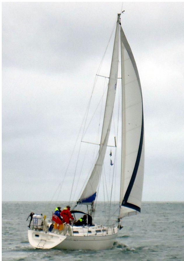
The eventual winner Danu approaching Bridge Buoy

The good sailing winds south of the Isle of Wight resulted in many yachts arriving at the Needles Channel between 1515 and 1615. This was well in advance of an eastward Solent tidal flow. The result being that yachts had now to battle against a tidal flow of circa 3 kn. This final leg sailing was downwind. Wind against tide produced some very bumpy conditions.