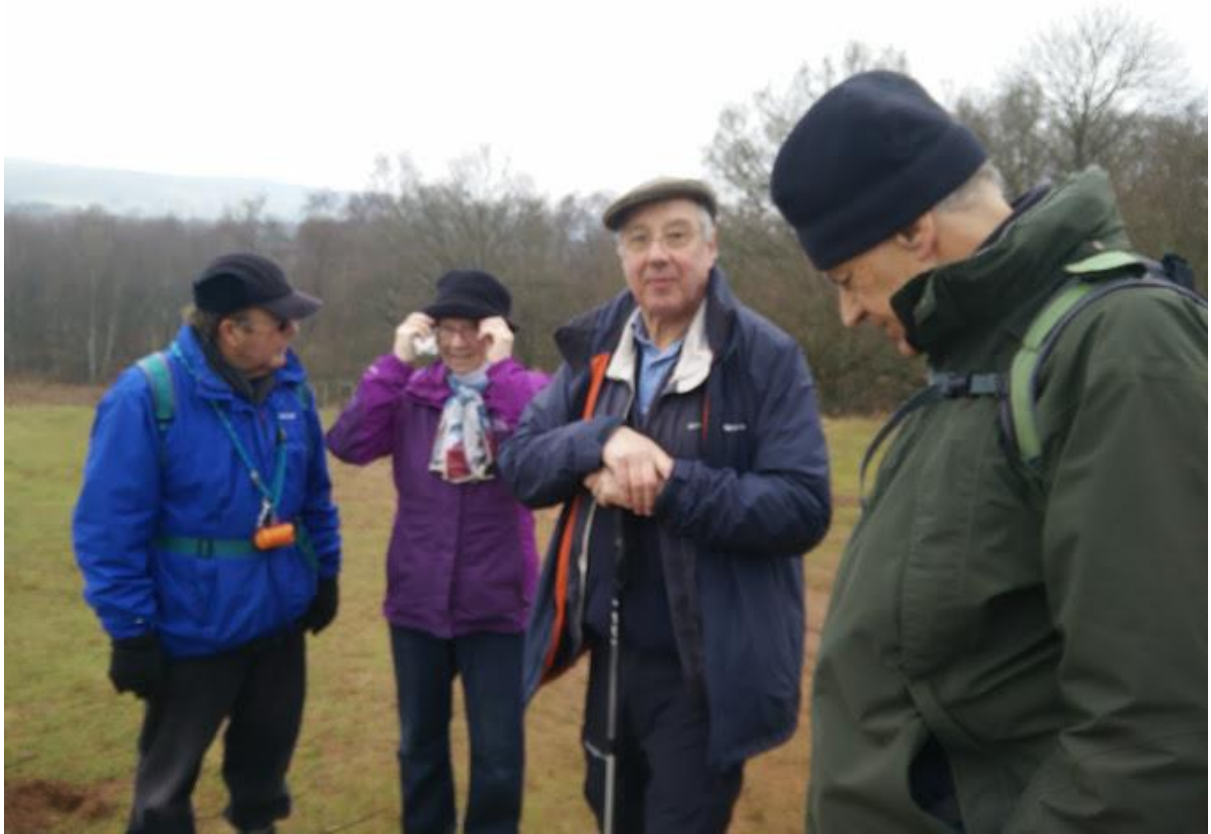
Our glorious leader